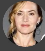
Kate Winslet Rose