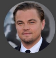
Leonardo DiCaprio Jack