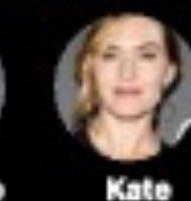
Kate Winslet Rose